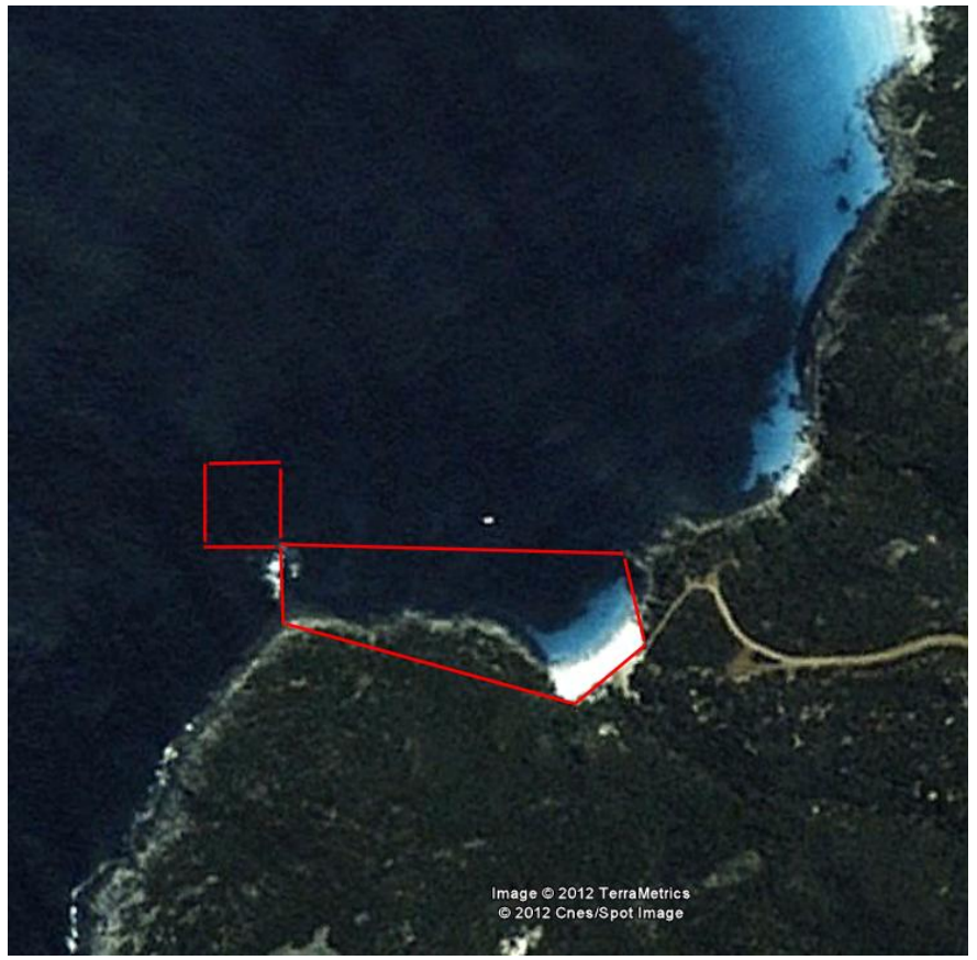
Proposed Habitat Protection Area - Little Boat Harbour, Bremer Bay